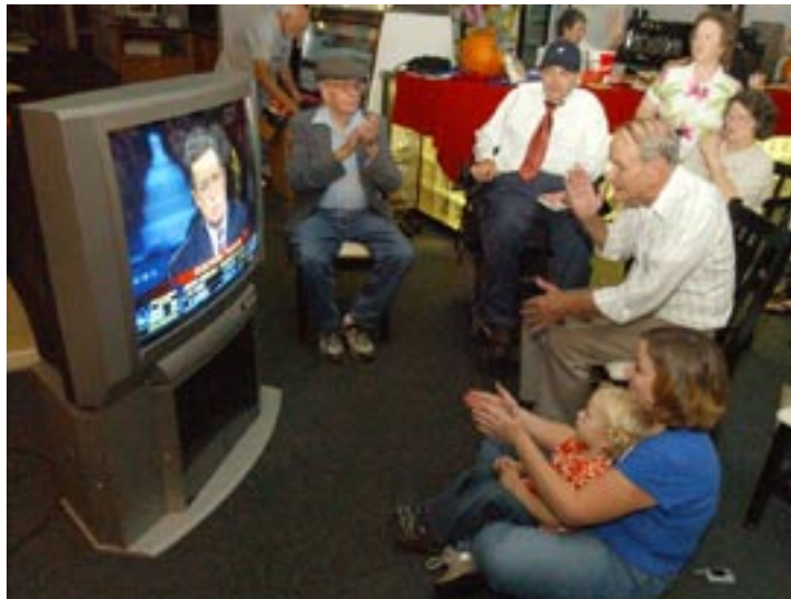
Television after World War II made national elections popular entertainment. Here, party loyalists gather to watch election returns at Republican headquarters in Meridian, Mississippi.

But democratizing pressures reemerged after World War II. For the first time, television provided a medium through which people could now see, as well as hear, the political campaigns in