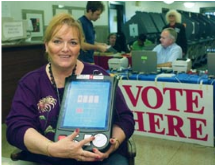
An election clerk displays a new voting device in Austin, Texas.

Recently, there has been a tendency to ease registration requirements. For instance, the 1993 National Voter Registration Act makes it possible for citizens to register to vote at the time they renew their state-issued drivers' licenses.