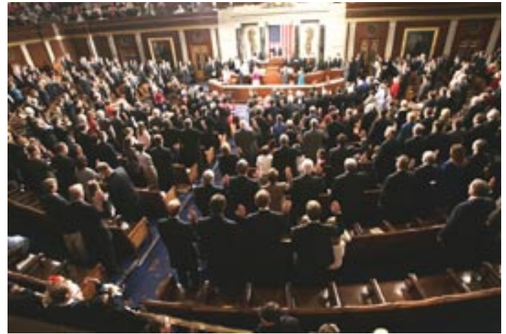
Members of the 109th Congress take their oath of office in the House chamber on Capitol Hill, 2005.

Unlike proportional systems popular in many democracies,