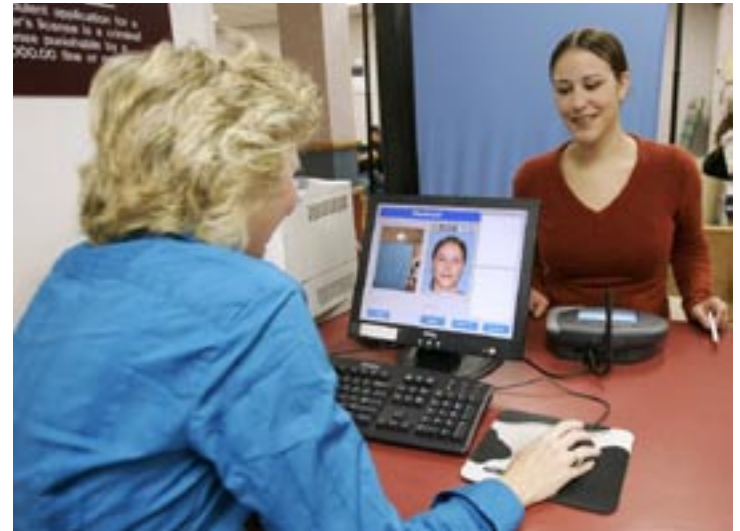
A young woman in Rhode Island signs up to get her driver's license and registers to vote, simultaneously.

One of the most important functions for election officials is ensuring that everyone who is eligible to vote is on the registration lists but that no one who is unqualified is included. Generally, local election officials err on the side of keeping people on the lists even if they have not voted recently, rather than eliminating potentially eligible voters. When people appear